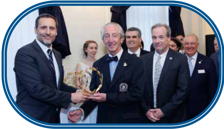
Marathon Wreath Ceremony 2023