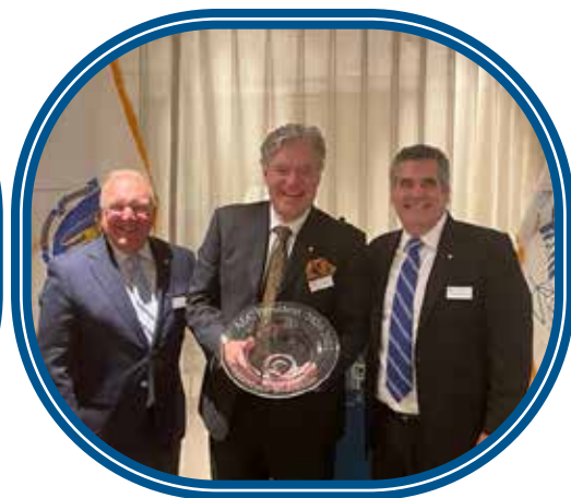
Honoring the 2022 Outgoing Alpha Omega Council President