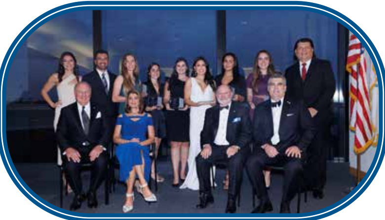
Recognizing 2022 Agris Scholarship Recipients