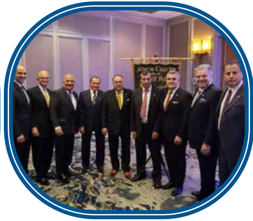
Honoring Order of AHEPA, our 2022 Lifetime Achievement Award Recipient & 100 years of Athens Chapter 24