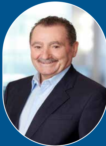
LIFETIME ACHIEVEMENT AWARD

HON. CAROLYN B. MALONEY Co-Founder Hellenic Caucus U.S. House of Representatives