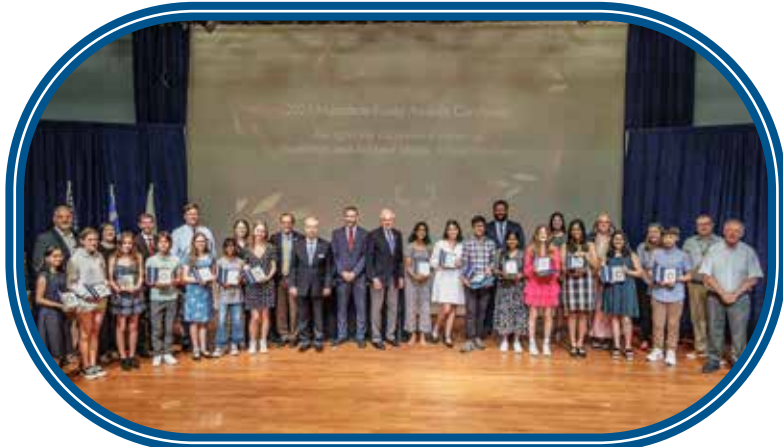
Marathon Education Committee Essay Contest Winners