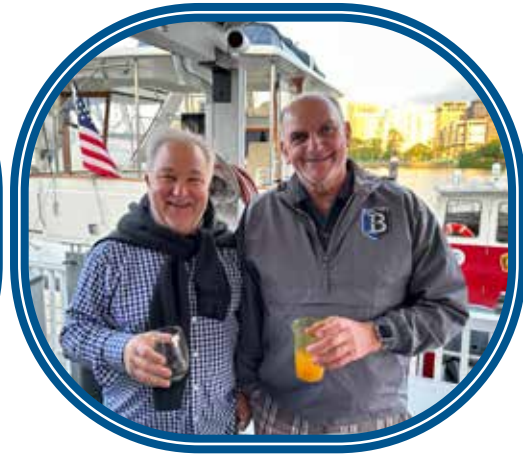
Celebrating Fellowship & Friendships - Hellas on the Charles 2023