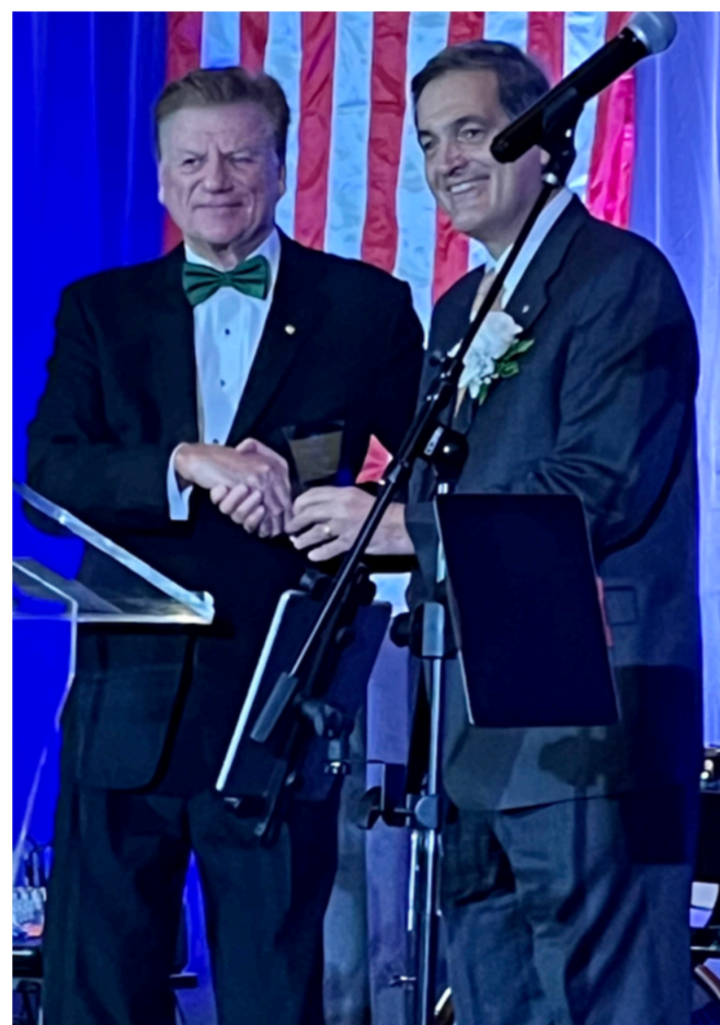
And a special thanks to Alpha Omega...

In the wake of the 2013 bombings at the Boston Marathon, the Council developed and launched educational programming for middle school educators and students, including essay contests, classics lectures, and tours of the Museum of Fine Arts and State House, to promote appreciation of the traditions of civic responsibility and defense of liberty that the ancient Greeks demonstrated at the Battle of Marathon.