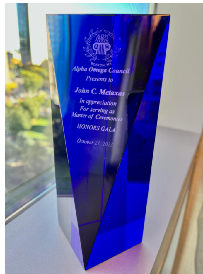
for acknowledging the MC.